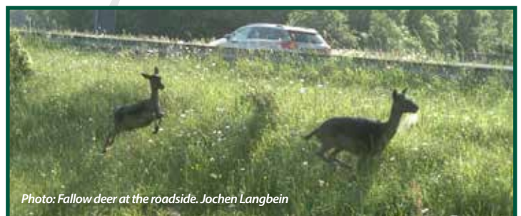
Photo: Fallow deer at the roadside.

The first Deer Management Plans came into force on the North West and South West Units from April this year, with the North East and South East areas following once these contracts are awarded and commence on site (expected April 2014). As this is a new contractual obligation it is anticipated that the Operating Companies will require a little time to get up to speed with the requirements of the Code and to prepare fully integrated Deer Management Plans. However, it is hoped that as the Plans develop they will help deliver more pro-active and effective deer management across the trunk road estate, ultimately benefiting both the welfare of the animals and the safety of road users.